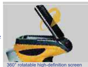
360° rotatable high-definition screen