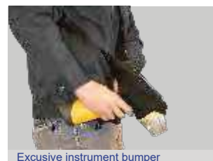
Exclusive instrument bumper