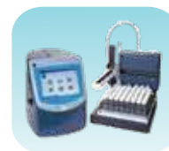
Total Organic Carbon 3800