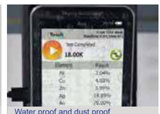
Water proof and dust proof