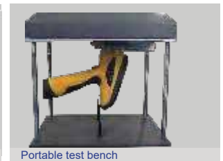
Portable test bench